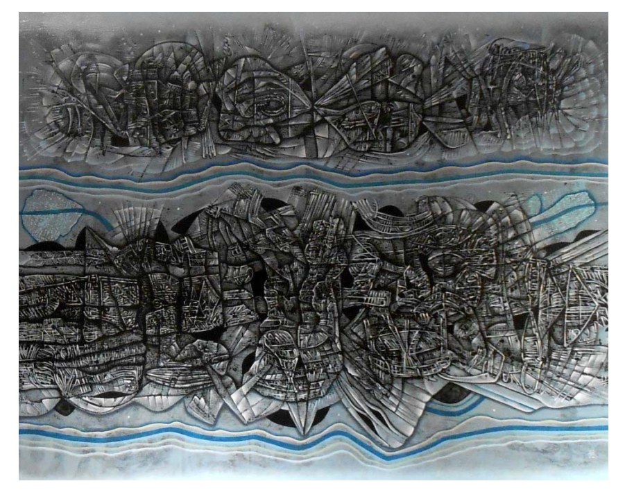
Jacques Lacomblez, Au-delà du paysage, 2009, coll. Lacomblez