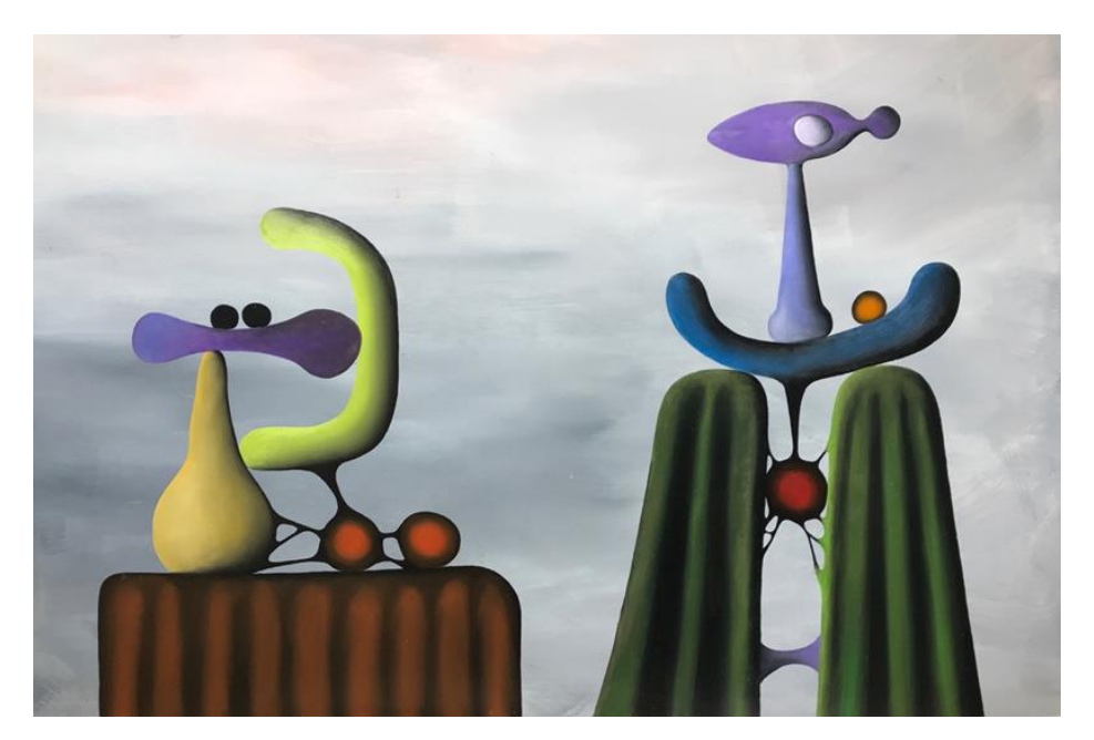
The Emissary, 2020, Oil on board, 61 x 91 cm

"Thanks to lockdown I finished this at 2.30am this morning."