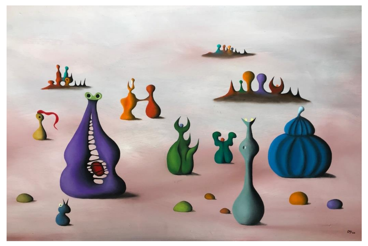
Landscape in Waiting, 2020, Oil on board, 51 x 76 cm

"When I was about 7, I went into the attic and found my grandfather's microscope. I brought it downstairs set it up on the kitchen table, went outside put some pond water on a saucer and placed it under the microscope. There were all these amazing moving creatures that I couldn't resist drawing. They inspire me still"