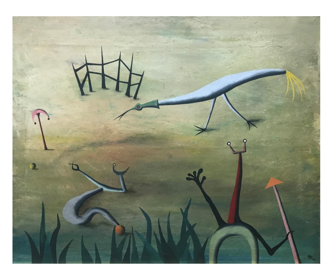
The Trap, 1950, Oil on canvas, 41 x 52 cm

"One of the joys of being 92 is that I have lived long enough to see some of my very early work resurface after being lost to me for many years. In 2020 a work that I had created seventy years earlier, called The Trap, re-appeared and is now included in this exhibition. It has come back to me as an old friend and I am fascinated by its details, as though they were painted by another artist. And, of course, in a sense, they were, because I was a very different person all those years ago. In 1950 I was at university, studying animal behaviour, and the drama taking place in this painting, showing a strange creature being coaxed into some kind of trap, would have been inspired by my zoological studies. But although it was influenced by them, there was no attempt to depict a naturalistic scene. The hunters and the hunted are imaginary, biomorphic beings."