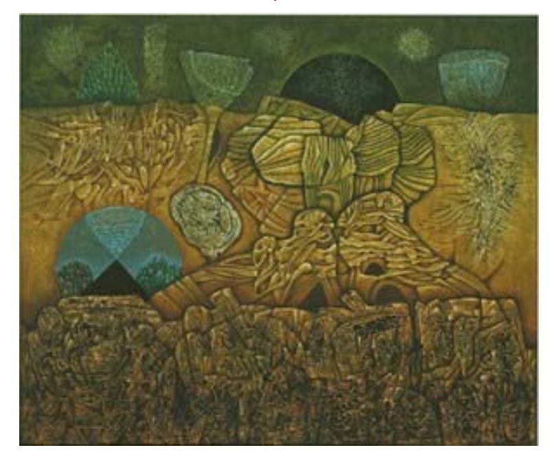
Jacques Lacomblez, Automne en Brocéliande, 2008, coll. Walter

June 18 - October 20, 2019 Rooms 4, 5, Philip West, First Floor